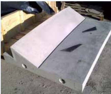
Above: The building comprises 56 irregular precast panels Below: Temporary jambs were cast in the window openings to ensure the structural integrity of the panels

"We would adapt the top, move the former at the base, and then cast a pair of panels," says Thorp. "We then had to remove the top end of the mould, replace it with another specially made