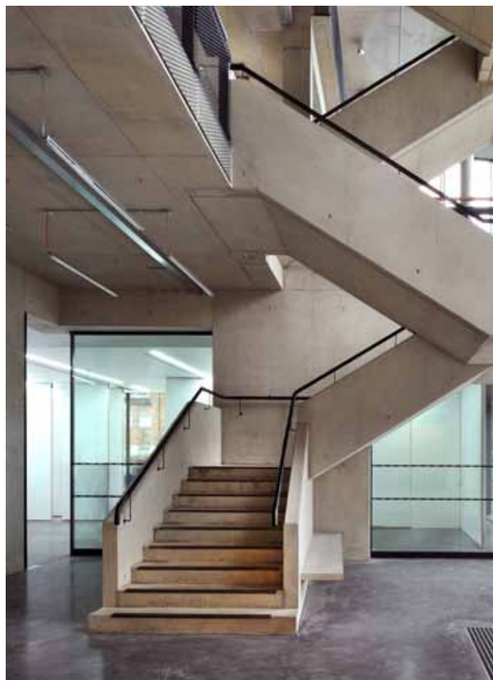
Haworth Tompkins' Dyson Building at the Royal College of Art is conceived as a creative "factory"